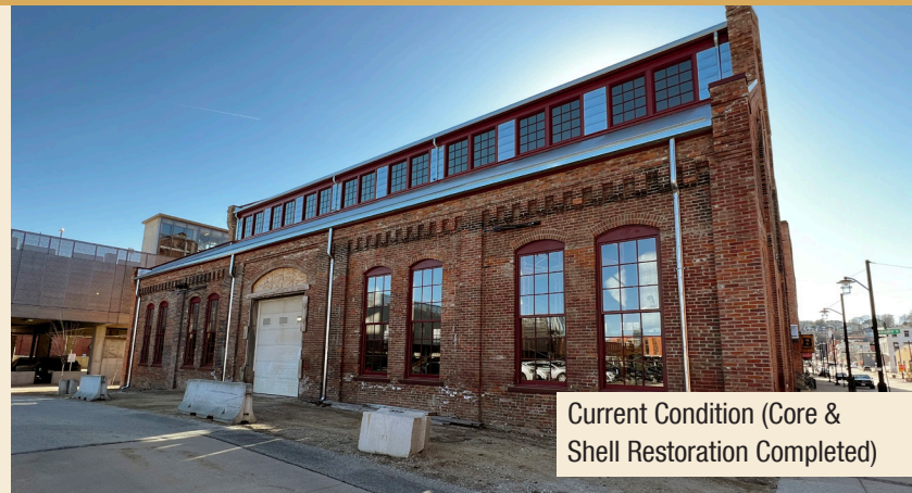
Current Condition (Core & Shell Restoration Completed)